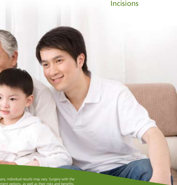
da Vinci Hysterectomy Incisions