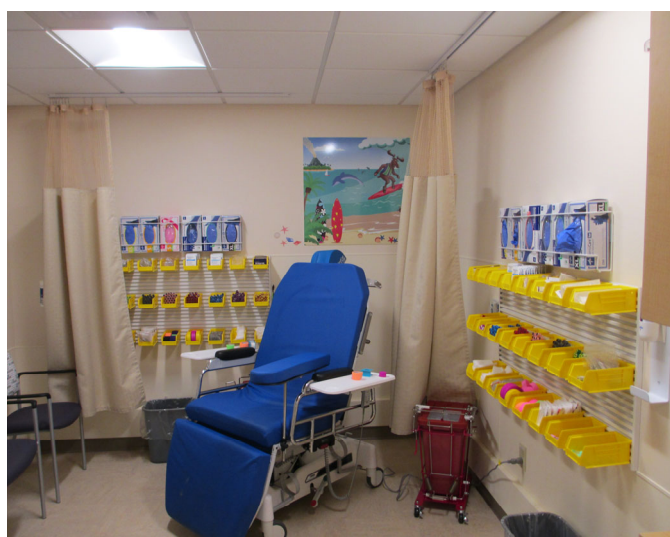
PRIVATE ROOMS WITH A PEDIATRIC THEME