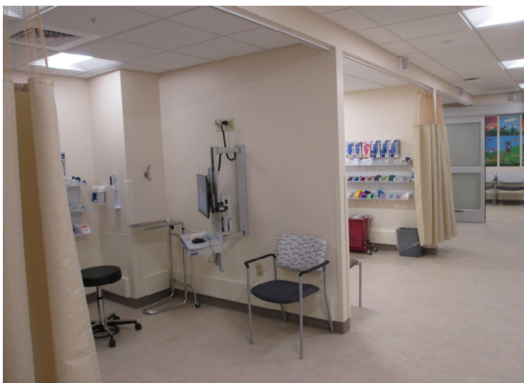
MORE SPACE AND BETTER WORKFLOW

This is our largest and busiest collection site where we can see up to 200 patients a day. The additional space makes for a safer and more private patient experience and the workflow in the new space has improved patient satisfaction.